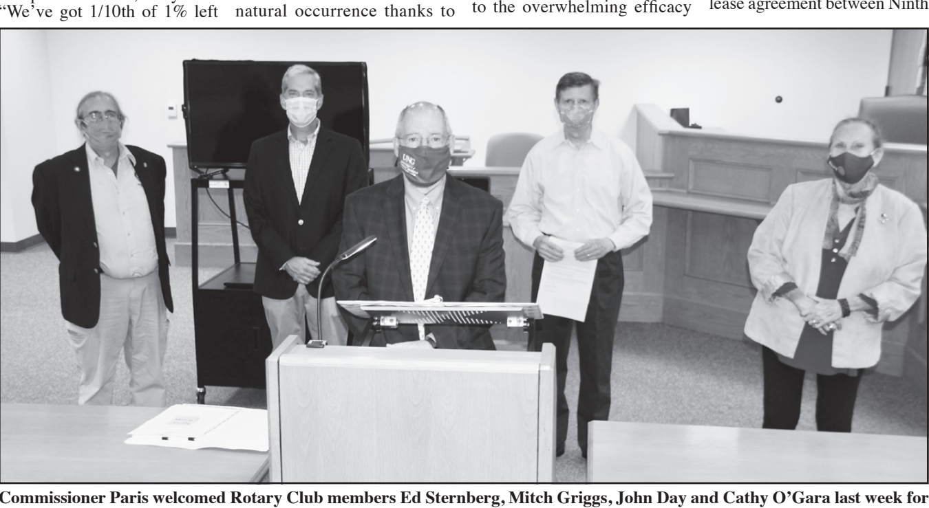
his "World Polio Day" proclamation.

For his part, Paris surprised Hadden by presenting her with a proclamation designating Oct. , 2020, as "Environmental Awareness Day," noting that Union County Government and its citizens must join together to protect and maintain the water quality of (local) bodies of